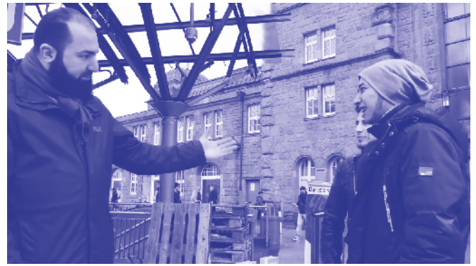
Young refugees at a Quran distribution stand in Hamburg.