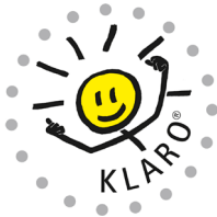
Figure 1: KLARO

Teachers and children are supplied with materials, such as audio CDs, parachutes, stethoscopes, posters and slides. The identification figure is KLARO (see figure 1).